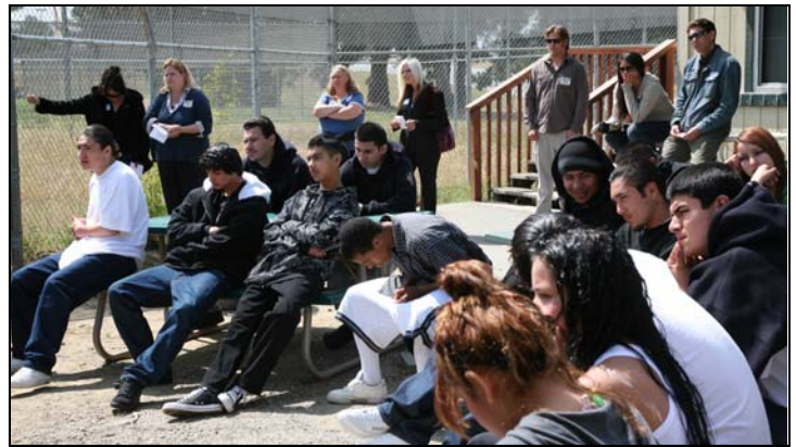
Students and teachers at the Salinas Peace Summit

"We are no safer living in Salinas, than in 3 rd world countries that do not have democracy. Statistically, gangs and violence are killing our youth at an alarming rate. If there was a disease running through our city, killing people at the same rate, we would have major global attention. So why is our crime rate being treated so differently? More citizens of Salinas have died in the last month from shootings and violence, than the Swine Flu has killed in the entire state (19 deaths in the whole US as of May 30, 2009). Why is our out-of-control crime rate not getting the same attention? There has been a major breakdown of family values. Most teenagers these days do not know what the word "family values" means