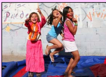
A GloMaj/BACU promoted exchange unites children in Mexico and Zimbabwe

Restorative Justice Commission, Mandell-Gisnett Center for Conflict Management, Monterey College of Law, the Monterey