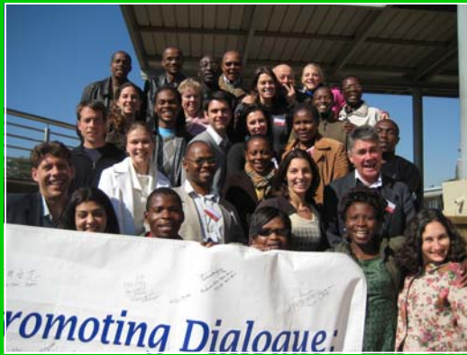
A Group Photo from Global Majority's first program in South Africa