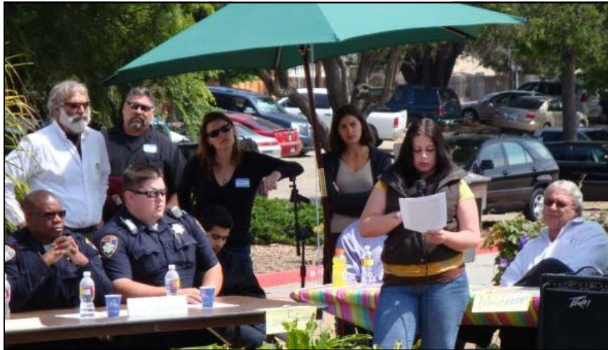
A student from the Salinas Community School shares her thoughts with law enforcement and community members at the school's Peace Summit

Over the past school year, Global Majority facilitated a weekly leadership class. The class organized monthly school events, was in charge of the student store, went to a career fair and on field trips, practiced public speaking, learned about skills in conflict resolution, wrote newsletters, wrote and conducted mediation simulations, and brought speakers to the students at the school. Meanwhile, the teachers of SCS incorporated conflict resolution education in the school-wide curriculum. The result was the year-end Peace Summit at which students displayed their Peace Murals; a Tibetan-style "prayer flag" containing messages of peace drawn by the students was put up in the air; community members and officials attended.