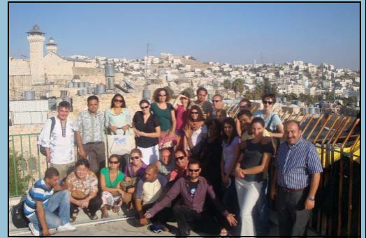
GloMaj participants in Jerusalem

Global Majority is proud to report a successful completion of our THIRD international seminar in the Middle East! It is significant that we've been able to maintain an annual presence in this zone of conflict, continuing to build relationships, bring opposing parties together, and create friendships across borders, walls, and deep political divides.